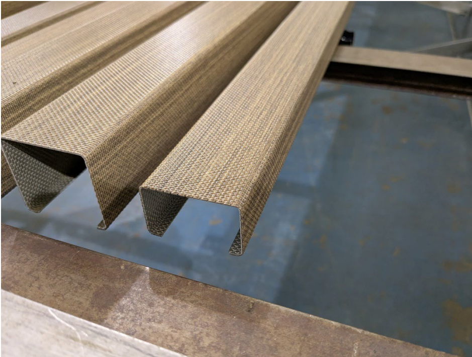
Figure 4 – Detail of specimen material