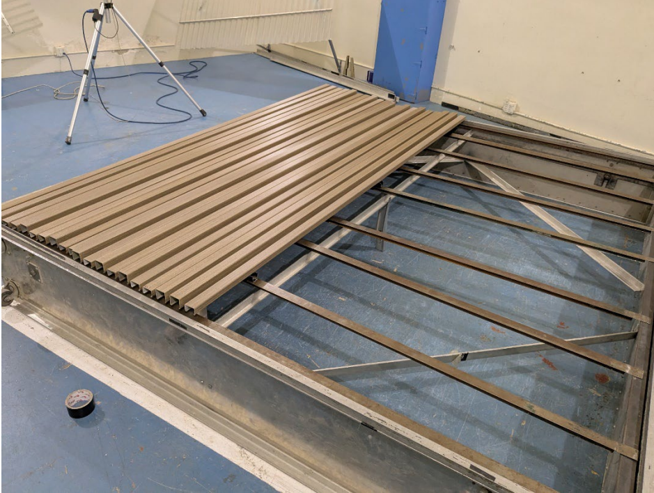
Figure 3 – Specimen partially installed in E-mount frame