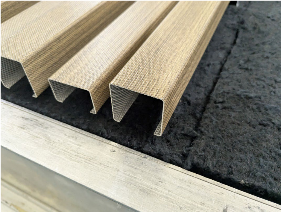
Figure 4 – Detail of specimen materials