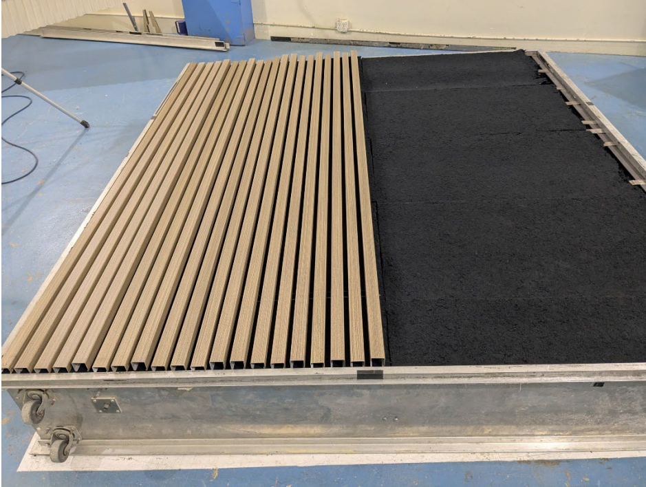
Figure 3 – Specimen pieces partially installed over base layer