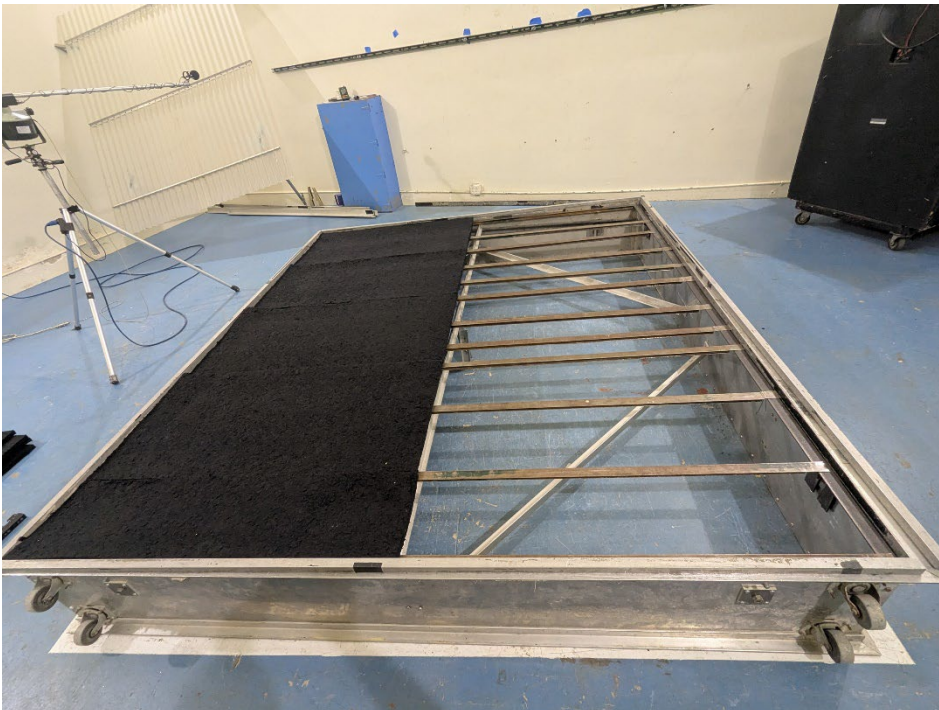
Figure 2 – Base layer partially installed in E-mount frame