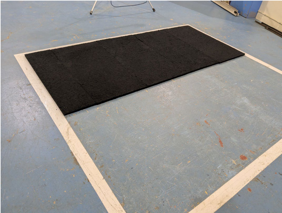
Figure 2 – Specimen base layer partially installed in test chamber