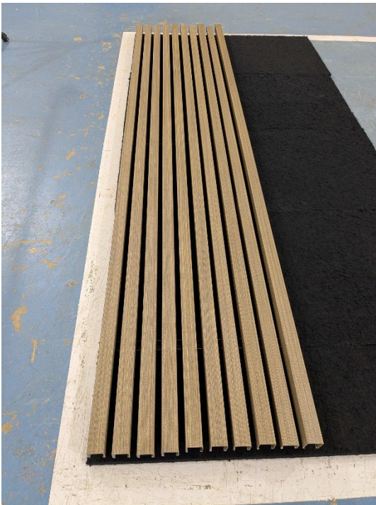
Figure 4 – Individual specimen piece