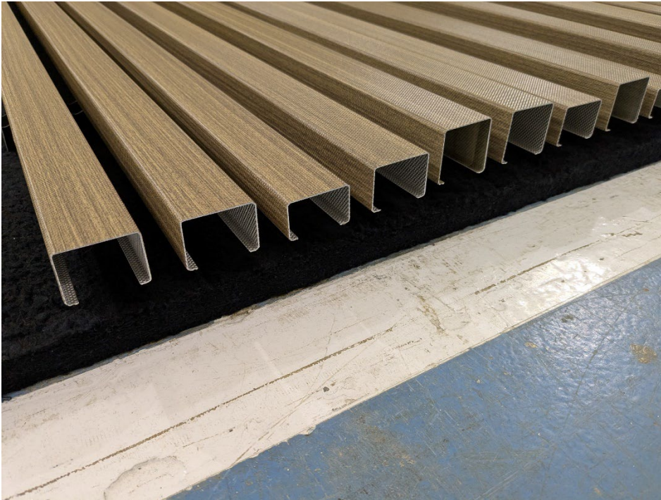
Figure 6 – Detail of specimen materials