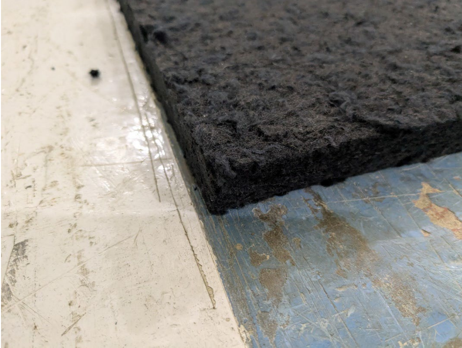
Figure 3 – Detail of specimen base layer material