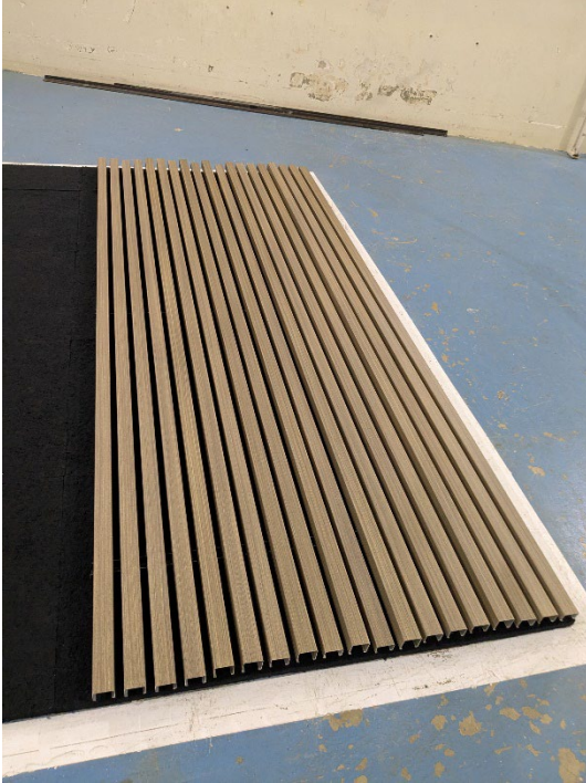
Figure 5 – Specimen pieces partially installed over base layer