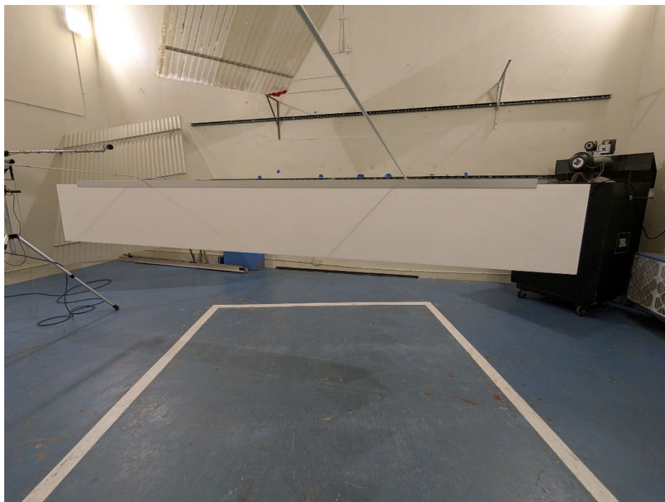
Figure 2 – Individual specimen object