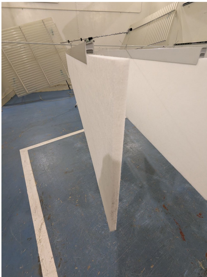
Figure 3 – Detail of specimen materials